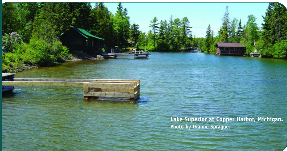
Lake Superior at Copper Harbor, Michigan.

RMEs are public or private organizations responsible for the operation, performance, and management of onsite systems within specific service areas. RMEs make the most sense to use when it is possible and desirable to manage a cluster of OWTS as a group. Such a scenario may occur when individual homeowners surrounding an inlet or small inland lake desire to protect that body of water. An RME could also be established when an agency desires to protect an environmentally sensi-