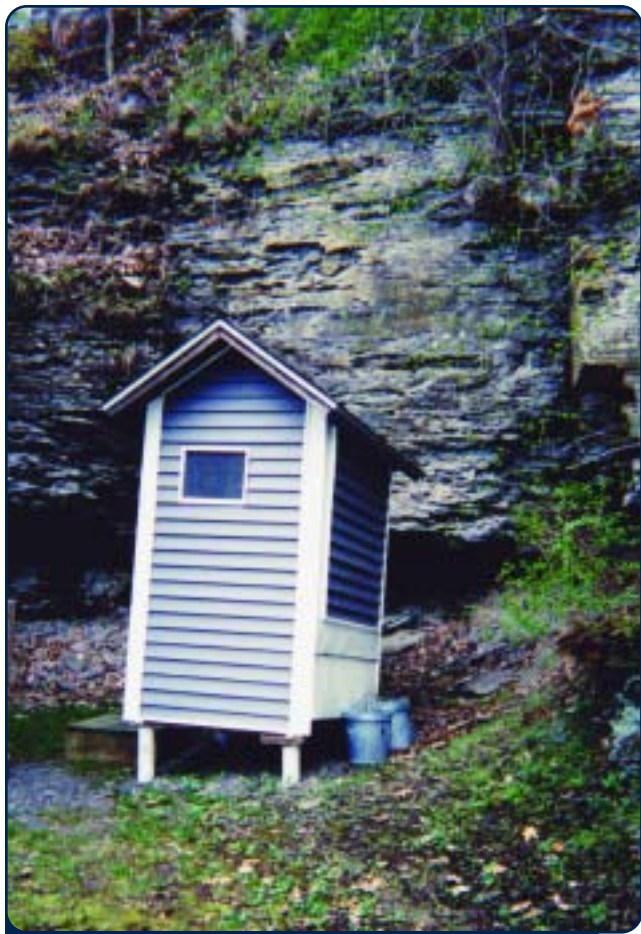
Privy behind a Skaneateles home shows the steep rocky terrain and limited land available for conventional onsite wastewater treatment systems.