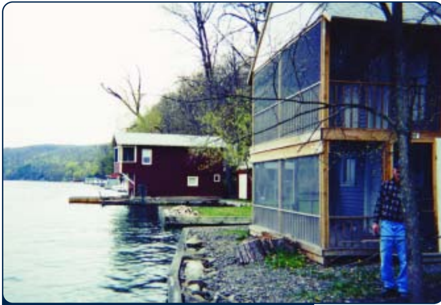
Some Skaneateles homes have been built partially extending out on the lake because of the limited land on the lakefront.

service with composting toilets was acceptable with the following conditions: