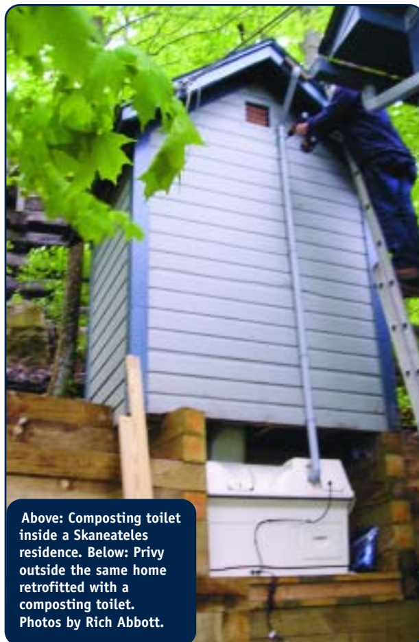
Above: Composting toilet inside a Skaneateles residence. Below: Privy outside the same home retrofitted with a composting toilet.

In regards to operation and maintenance, the city and vendor worked closely with property owners, instructing them as to the correct amount and frequency of bulking material to be added to the compost chamber, as well as to the proper blend of material if